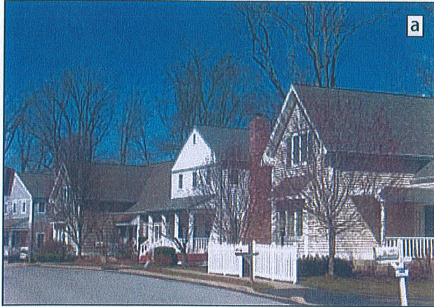
Eagleview TND - Dwellings along the Build-To Line