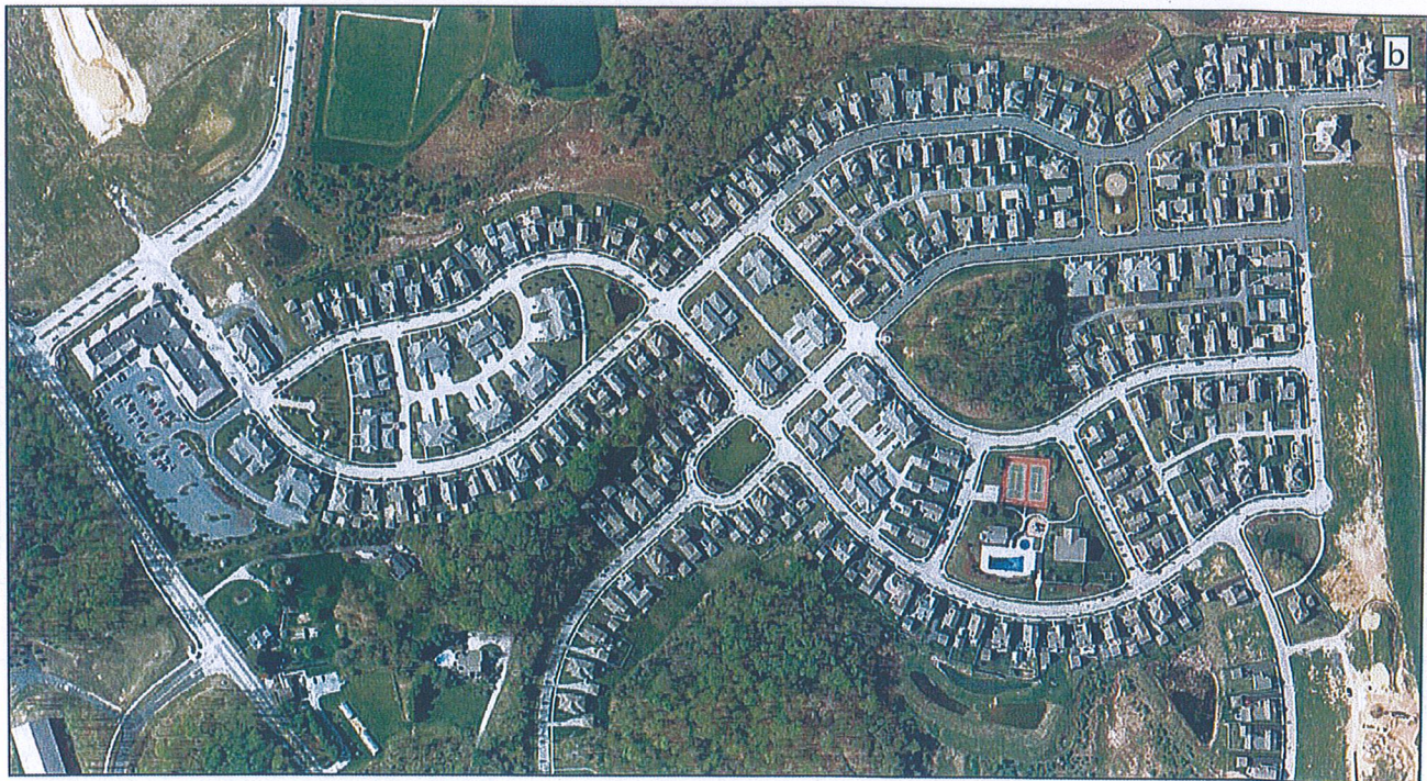
Weatherstone TND, West Vincent Township, PA