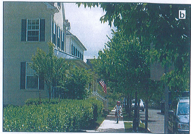
Lantern Hill TND - Dwellings along the Build-To Line