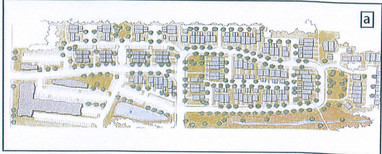
Lantern Hill TND, Doylestown, PA