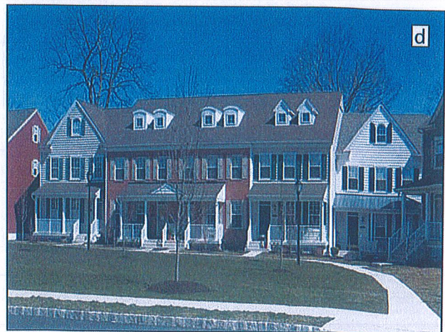
Lantern Hill TND - Dwellings fronting on internal Open Space