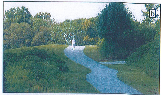
Concord Township - Non-motorized Path