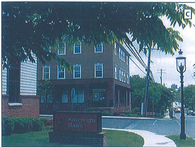
Lantern Hill TND - Corner building along the Build-To Lines