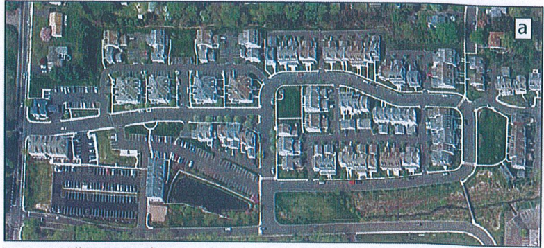
Lantern Hill TND, Doylestown, PA