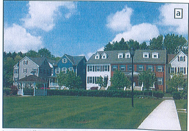
Lantern Hill TND - Sidewalk through Open Space